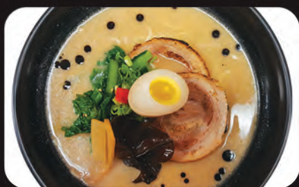
Tonkotsu Zen 11.5

pork base, chicken base, seasoned egg ear wood mushroom, bamboo shoot red ginger, bok choy