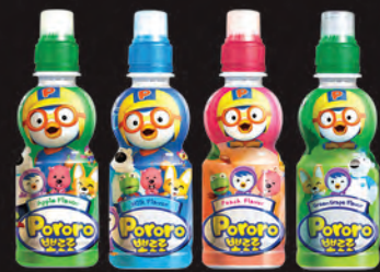
Apple / Milk / Peach / Green Grape