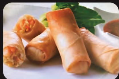
Vegetables Spring Roll 5.5

* CONSUMING RAW OR UNDERCOOKED MEATS, POULTRY, SEAFOOD, SHELLFISH OR EGGS MAY INCREASE YOUR RISK OF FOODBORNE ILLNESS. PLEASE INFORM YOUR SERVER OF FOOD ALLERGIES.