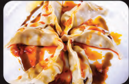
Spicy Gyoza 6.95