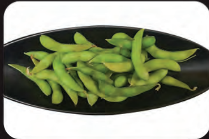
Edamame 4 spicy garlic (add 1.5)