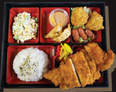
Fish Kasu Box 18.5 tilapia fish fried with teriyaki sauce