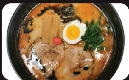
Tonkotsu Kamikaze 12.95

fresh noodle, chasu pork house special spicy sauce