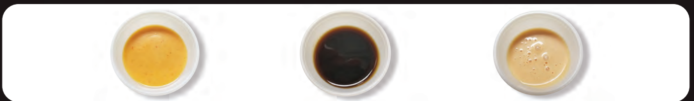
Sauce (2oz) 0.5 | spicy mayo, eel sauce, Yum yum sauce