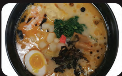
Tonkotsu Spicy Seafood 13.95

fresh noodle, chasu pork house special spicy sauce