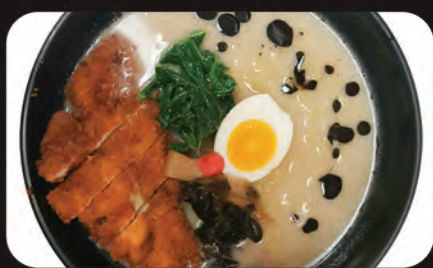
Tonkotsu chicken 11.95

fresh noodle, pork chasu sweet corn, black garlic oil