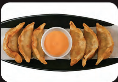
Fried Pork Gyoza 6.5