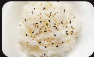
Sushi Rice 2.5