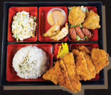
Chicken Kasu Box 14.5 deep fried chicken tender with teriyaki sauce, spicy mayo