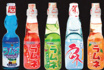
Blue Hawaii / Melon / Orange Strawberry / Original