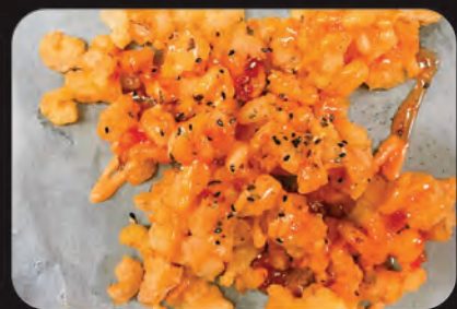
Pop Rock Shrimp 9.5 fried shrimp with spicy cream sauce