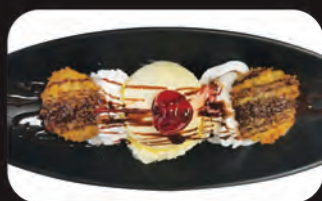
Fried Oreos 6 with vanilla ice cream