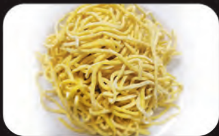
Ramen Noodle 4.5