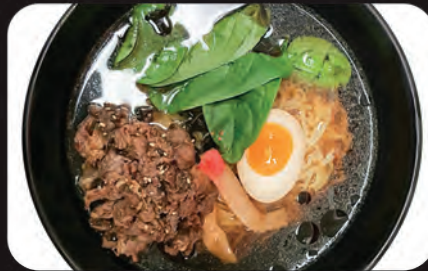
Shoyu Bulgogi 13.95 Korean beef Shoyu Chicken 12.5 soy marinated Korean BBQ chicken