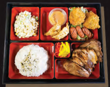
Pork Chasu Box 15.5 slowly cooked pork, teriyaki sauce