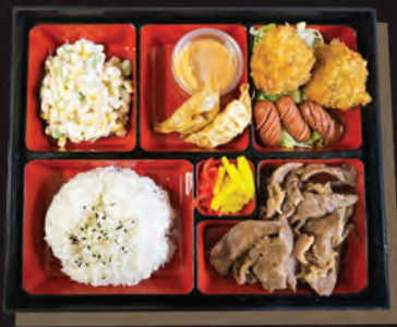
Bulgogi Steak Box 🌶️ 16.5 soy seasoned grilled steak teriyaki sauce