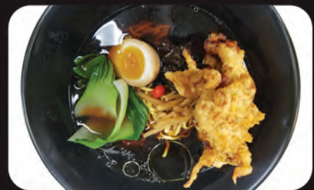
Shoyu Black 13.5 fried chicken with black garlic oil sweet corn