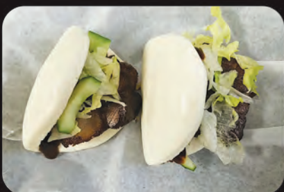
Pork Bun 7 Chicken Bun 7 sweet spicy sauce