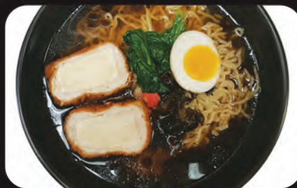
Shoyu Chicken Cheese Katsu 14.95 chicken tender wrapped fried cheese