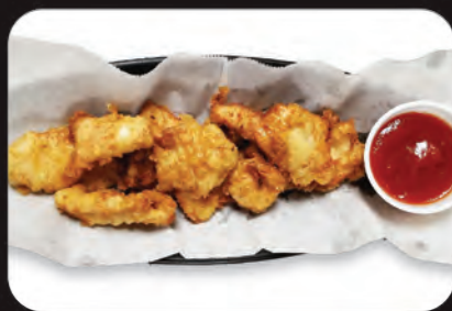
Chicken Karaage 7.5 marinated chicken fried