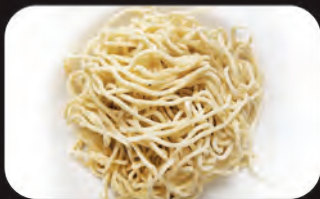
Ramen Noodle 4