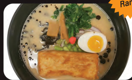
Vegetarian Miso 10.95

two fresh noodle, chasu pork fried pork gyoza