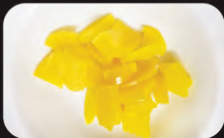
Yellow Pickled Radish 3