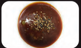
Vampire Sauce 5 garlic, hot pepper special sauce