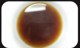
Shoyu Ramen Broth 6