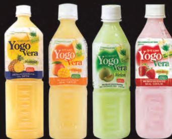
Pineapple / Mango / Melon / Strawberry