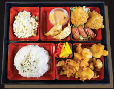
Fried Shrimp Box 16.5 deep fried shrimp with sweet chili spicy mayo