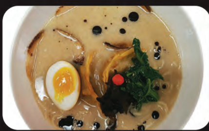
Tonkotsu King 14.95

two fresh noodle, chasu pork fried pork gyoza