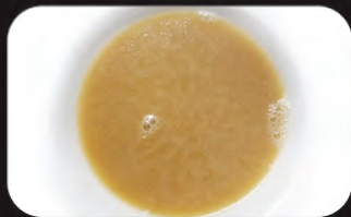
Tonkotsu Ramen Broth 6