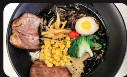
Tonkotsu Black 13.5

fresh noodle, cooked shrimp scallop, house spicy sauce