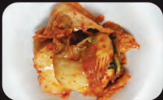
Fresh Kimchi 3