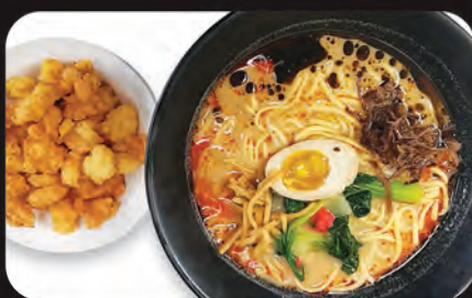
Tonkotsu Spicy Shrimp 13.5

fresh noodle, chasu pork with house spicy sauce