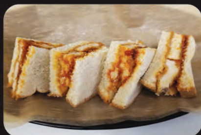
Chicken Kasu Santos 7.5 deep fried chicken tender with special sauce