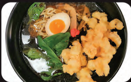
Shoyu Shrimp 13.95 fried shrimp Shoyu Soft Shell Crab 15.95 fried soft shell crab