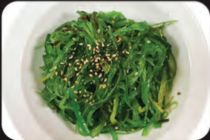
Seaweed Salad 4