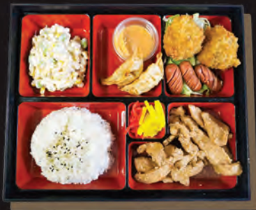
Grilled Chicken Box 🌶️ 14.5 soy seasoned grilled chicken teriyaki sauce

steam rice, corn edamame salad, fried gyoza fried meat ball, sausage, lettuce pickle