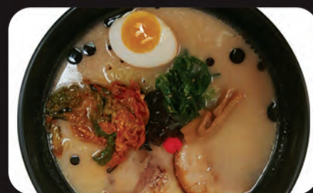
Tonkotsu Kimchi 12.95

fresh noodle, fried shrimp house spicy sauce